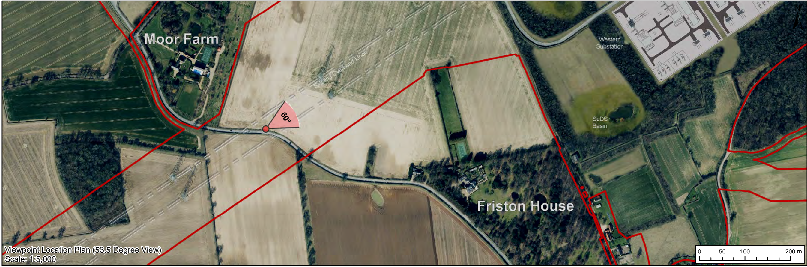
Viewpoint Location Plan (53.5 Degree View) Scale: 1:5,000