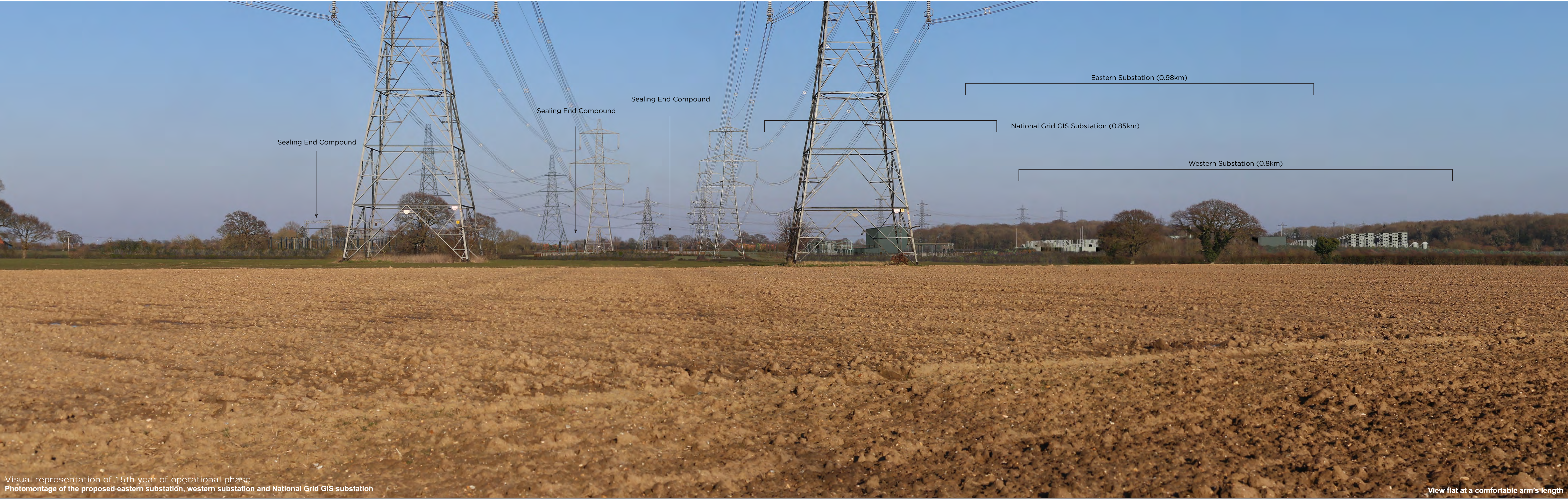
Visual representation of 15th year of operational phase Photomontage of the proposed eastern substation, western substation and National Grid GIS substation