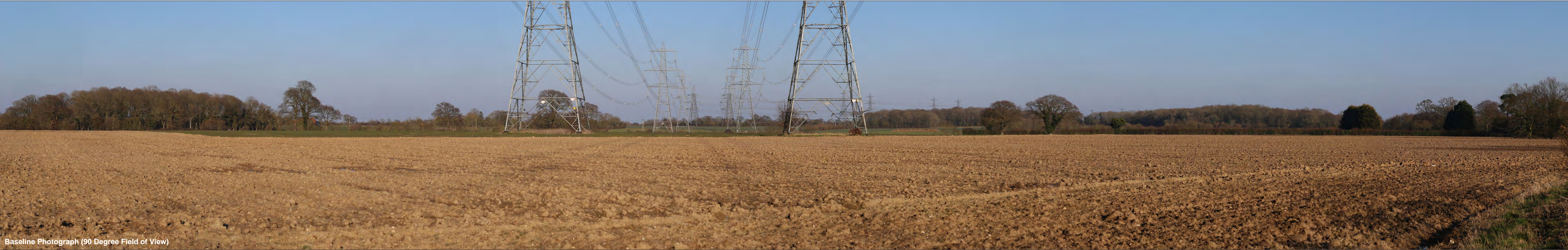
Baseline Photograph (90 Degree Field of View)